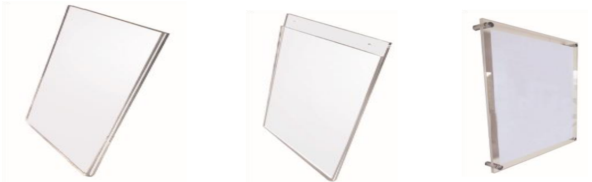
Wall mounted print holder Hanging print holder (fixing holes) Poster Holder