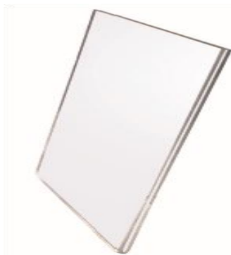
Wall mounted print holder