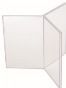
Six-sided print holder