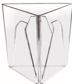
Three-sided print holder