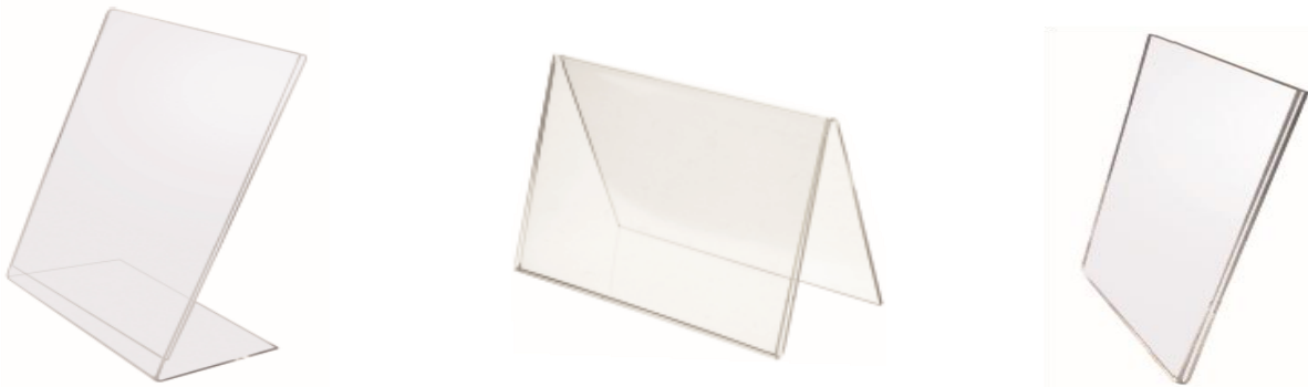
Single sided print holder 'V' tent print holder (Landscape only) Wall mounted