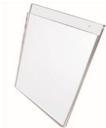
Optional fixing/hanging holes