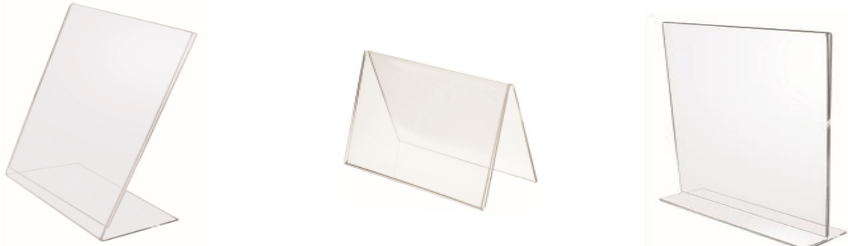
Single sided print holder 'V' tent ticket holder (Landscape only) Double sided