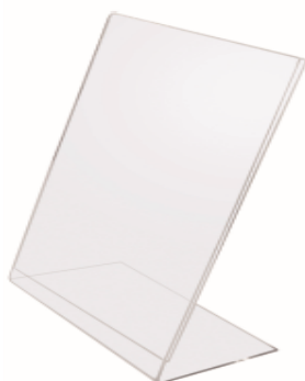
Single sided print holder