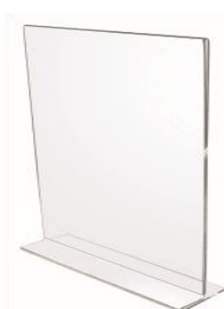
Double sided print holder