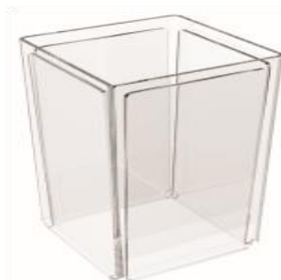
Four-sided print holder