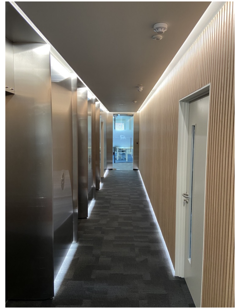
Brushed satin stainless steel opposing nature wall

Room Type: Circulation spaces: Corridors: Specifier: Fortebis Contractor: Sykes & Son Limited