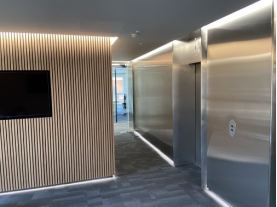
Bushed satin stainless steel