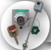
Liquid Level Sensing