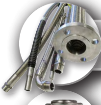
Metallic & PTFE Hose Assemblies