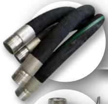
Rubber Hose Assemblies