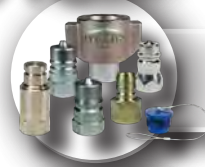
Quick Disconnect Couplings