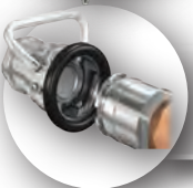
Dry Disconnect Couplings