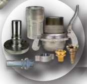
Hose & Pipe Fittings