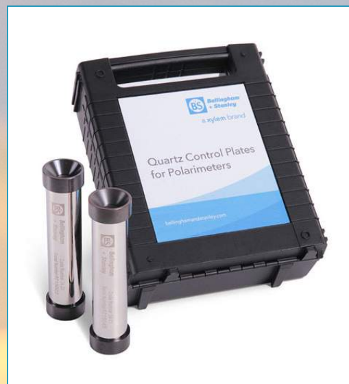
Fig 2. Quartz Plates, available in single or multiple box sets

In order to better suit customer needs, ADP600 Series polarimeters are now designed around a modular selection guide. This approach means customers will have everything they need for their application without spending excess money on things that they don't.