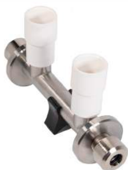
Standard XPC tubes

Special tubes, HCl (hydrochloric acid) tubes, XPC Adaptors and cover glasses for ultra-violet measurement are also available. Please visit our website for further details.