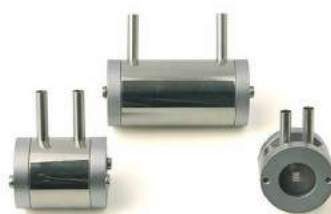
Low volume XPC tubes