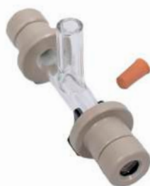
HCl XPC tubes