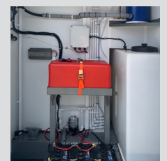
Integrated Diesel/ Electric power